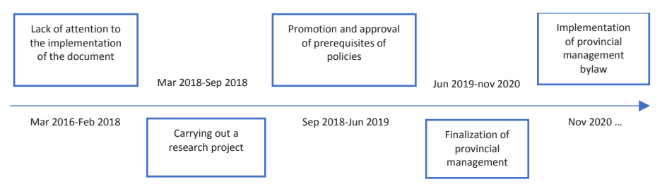
Figure 3. Time frames for the implementation of the bylaw of the provincial management of higher education

In the conducted research, policy implications were presented for the implementation of the SPHE document as a policy document in the country. Of course, researchers can present additional policy implications from various perspectives in future studies, building upon the narratives conducted in this research. The SPHE document is one of the most significant policy documents in the country's higher education system after the Islamic revolution. Its articles 1 and 2, which emphasize regional management, are particularly important in this document. The implementation process of this policy can be divided into five time periods (Figure 3).